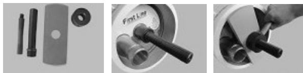
FIRST LINE head removal tools

FIRST LINE Head Removal Tools - A set of head removal tools is available from FIRST LINE. These head removal tools are expressly designed for the purpose and have proven to be an effective and easy way to remove the vessel head without causing any damage to the vessel.